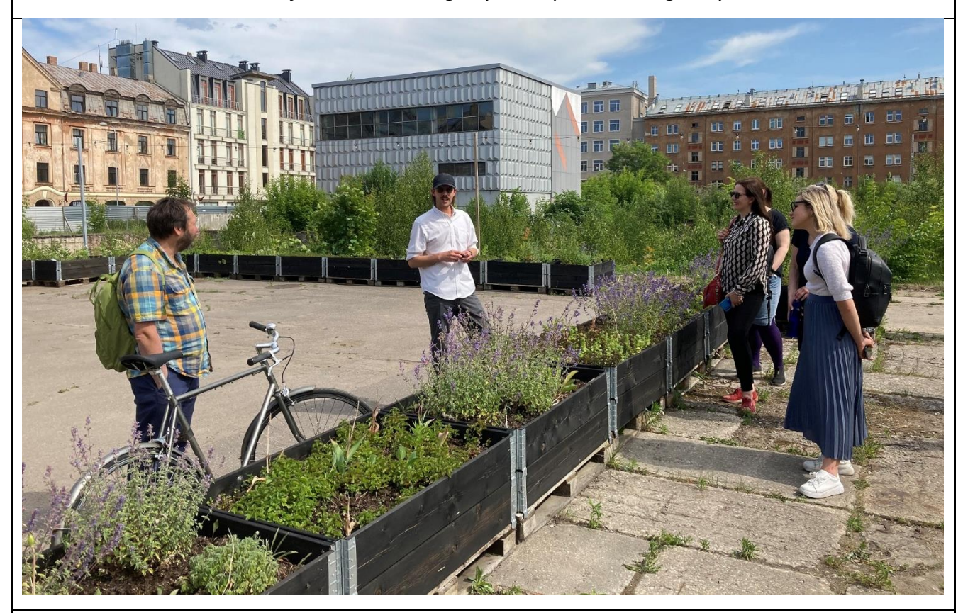
Community garden "Sporta Pils dārzi" by Mārtiņš Enģelis, Riga City Council