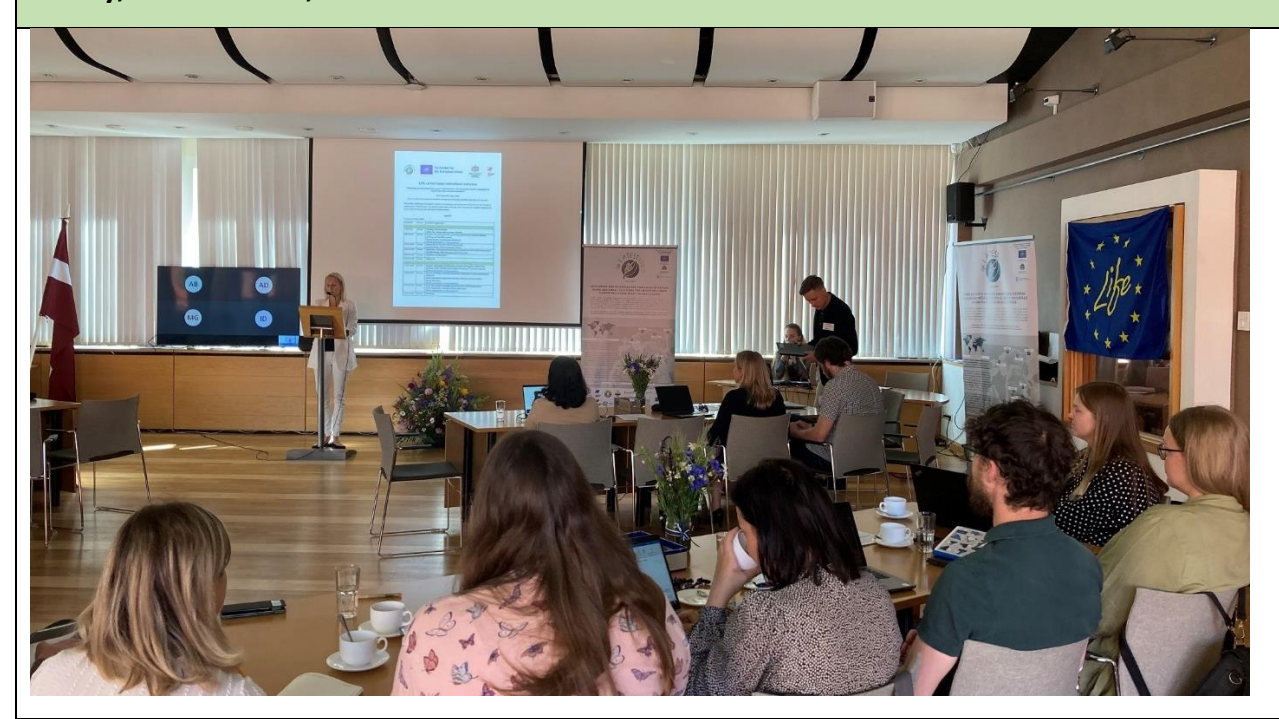
Opening of the workshop by Ilze Oša, Deputy state secretary, MoEPRD

1<sup>st</sup> day, 13 June 2023, SESSION I: Introduction