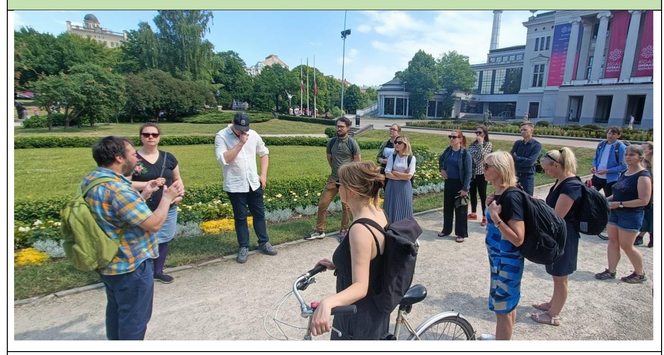
Introduction to greening solutions in Riga by Andris Ločmanis, Riga City Council