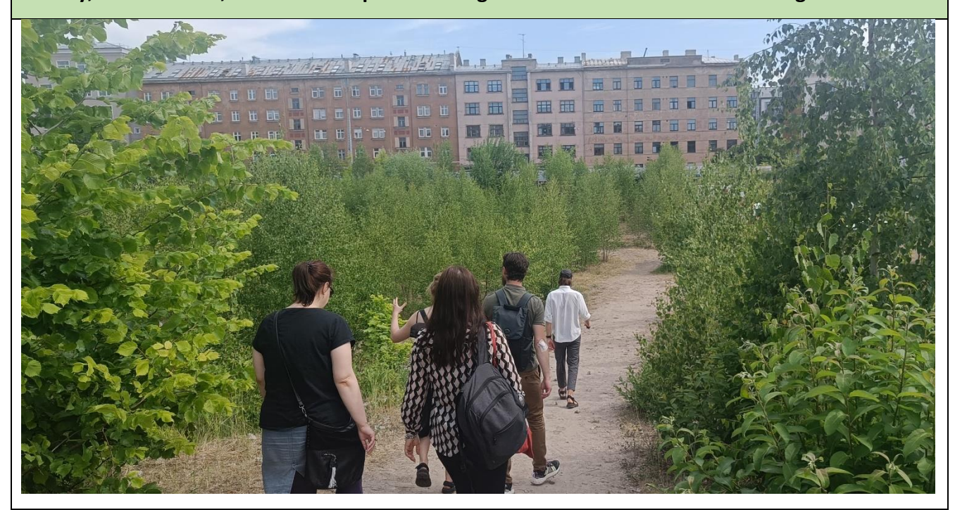
Community garden "Sporta Pils dārzi"