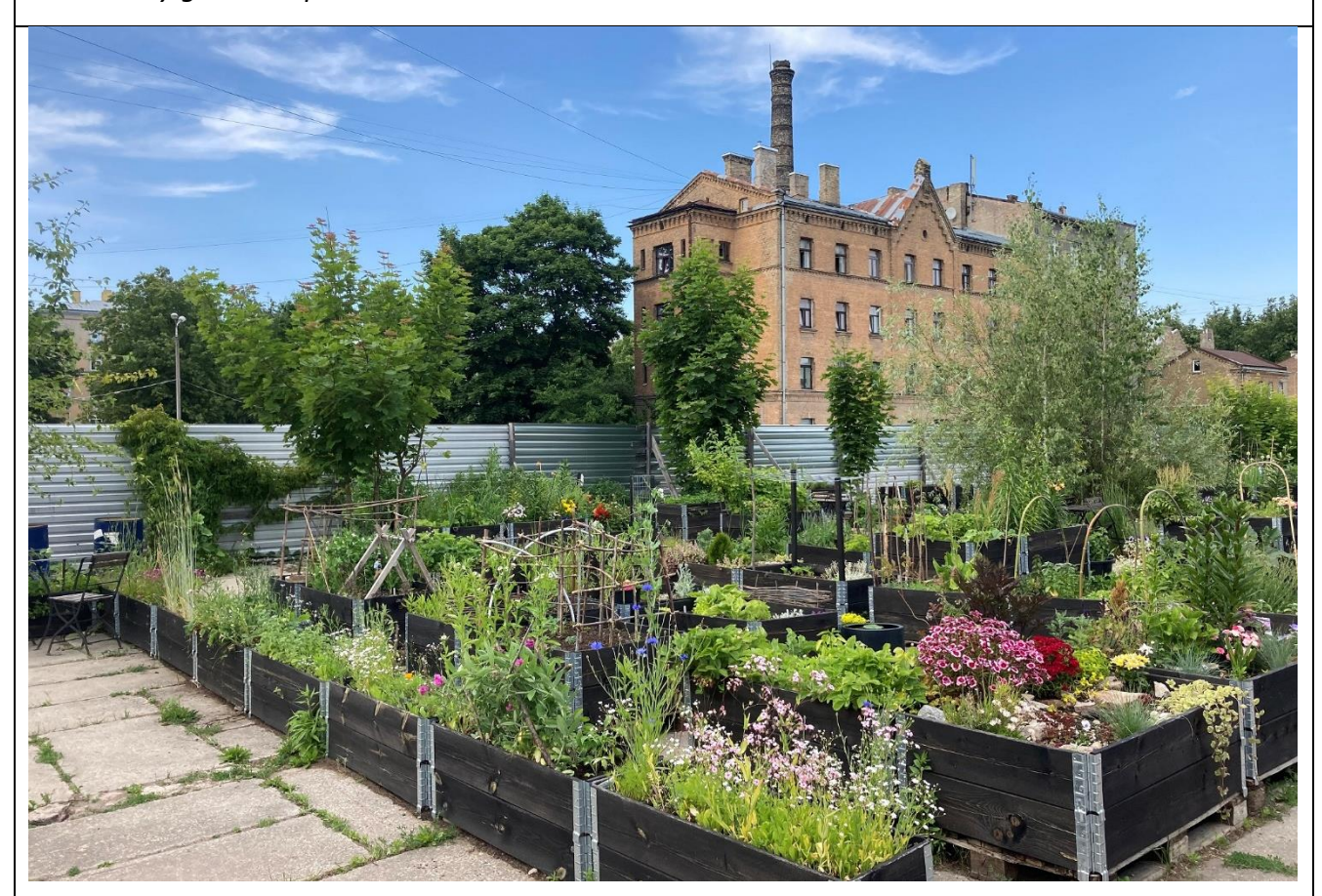
Community garden "Sporta Pils dārzi"