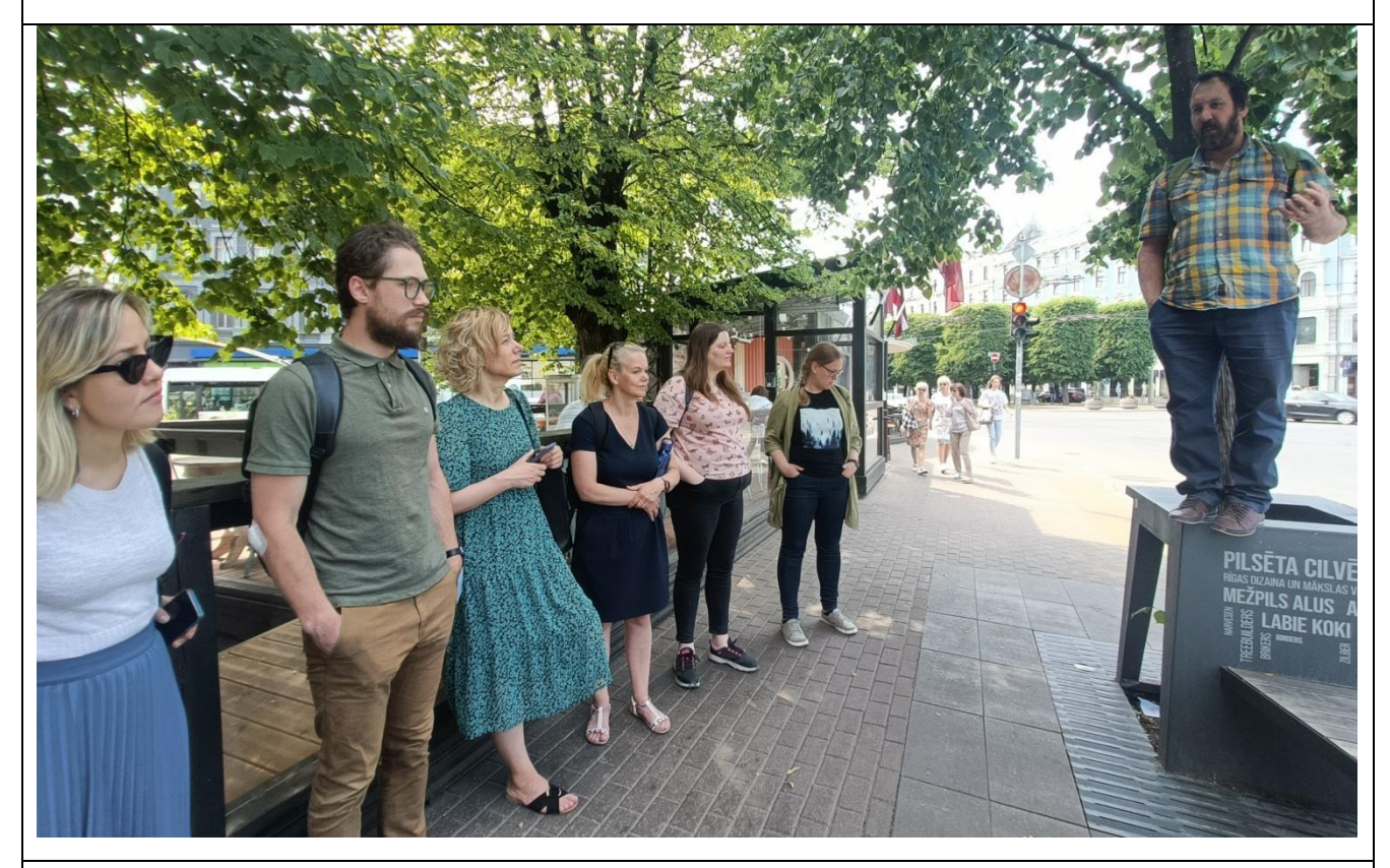
Example of community initative to support urban green infrastructure