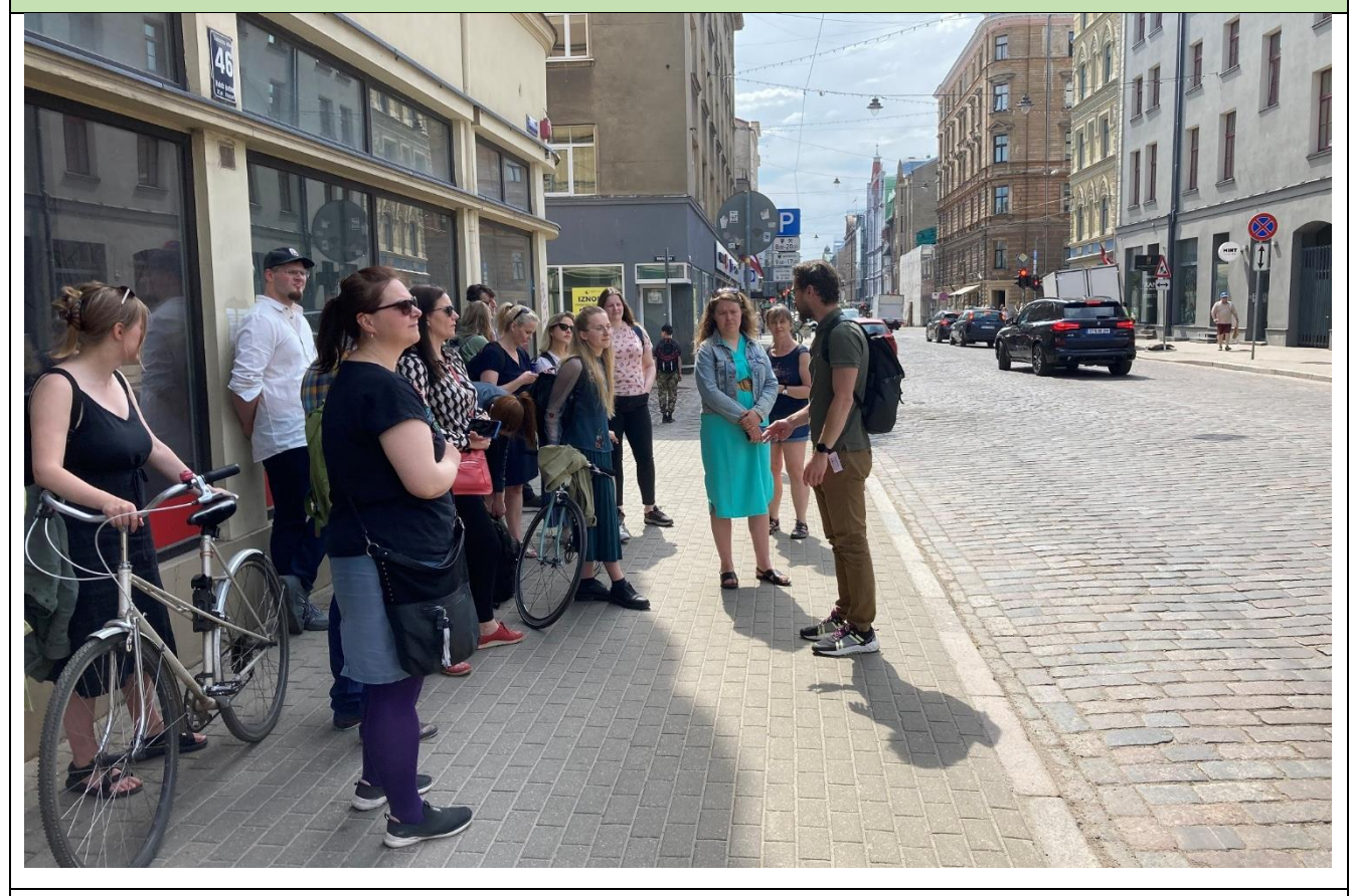
Planned demonstration site of urban NBS in Riga by Kristaps Zēvals, Riga City Council